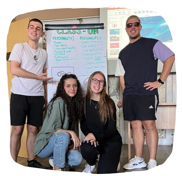
Trip for a project meeting in Macedonia