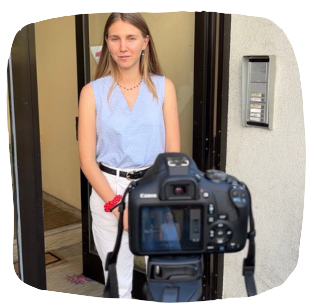
Video filming for YouTube