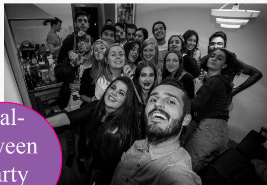
Hal- loween Party

USEFULL LINKS: fb: @stowarzyszeniestrin Some interesting videos: vimeo.com/190831333 vimeo.com/203999363 vimeo.com/189454646