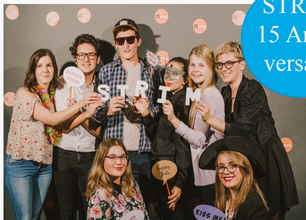
STRIM 15 Anniversary