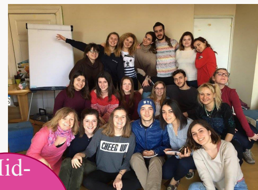
Mid-term training in Torun