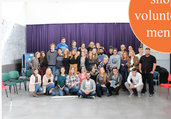
Workshop 4 volunteers & mentors