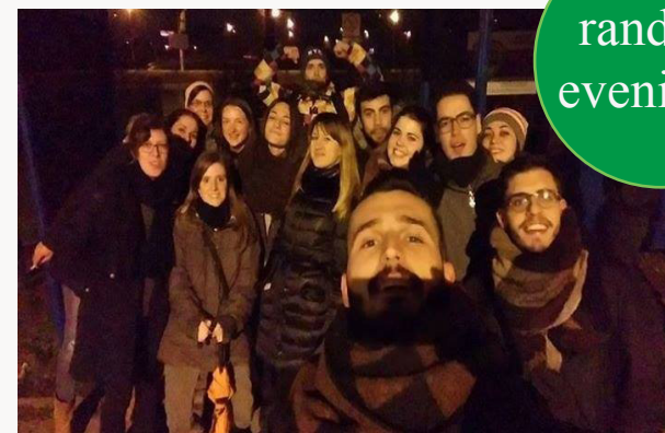
Just random evening...

USEFULL LINKS: fb: @stowarzyszeniestrin Some interesting videos: vimeo.com/190831333 vimeo.com/203999363 vimeo.com/189454646