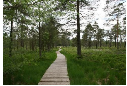
Bad Wurzach is surrounded by a preserved area called "Ried"

You want to live in a small town in an amazing surrounding? (just look at this video about the Wurzacher Ried: