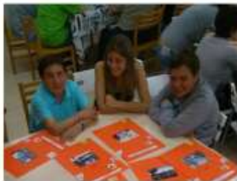
COMUNITAT ELS AVETS - Moia