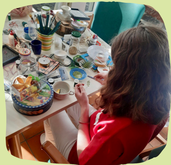
Activities with tempera colors