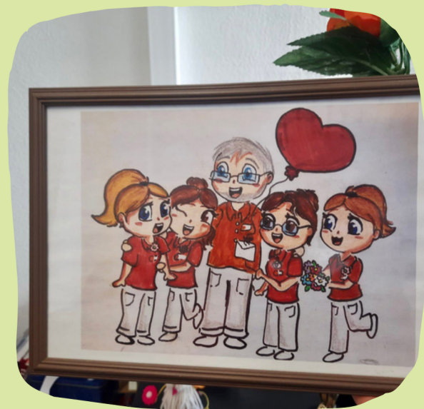
Drawing portraying the staff