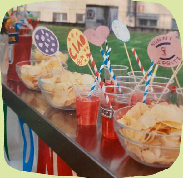
"Nonni Spritz" Project