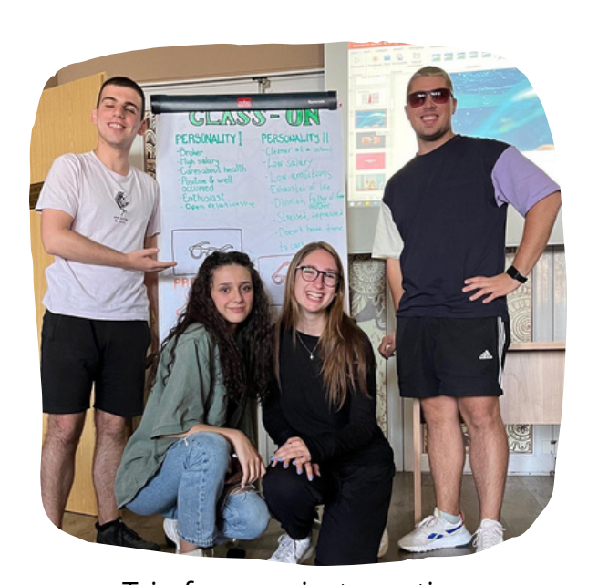
Trip for a project meeting in Macedonia