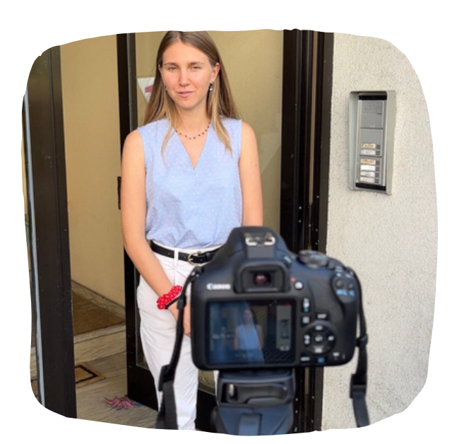
Video filming for YouTube