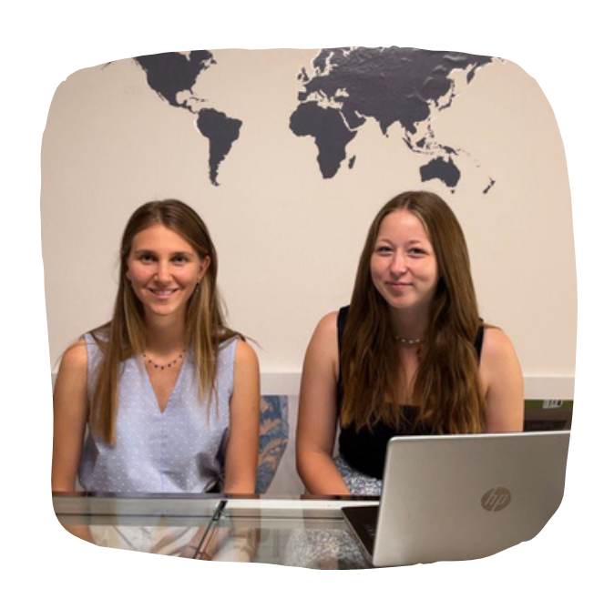
Social Media "Dream Team" Meeting