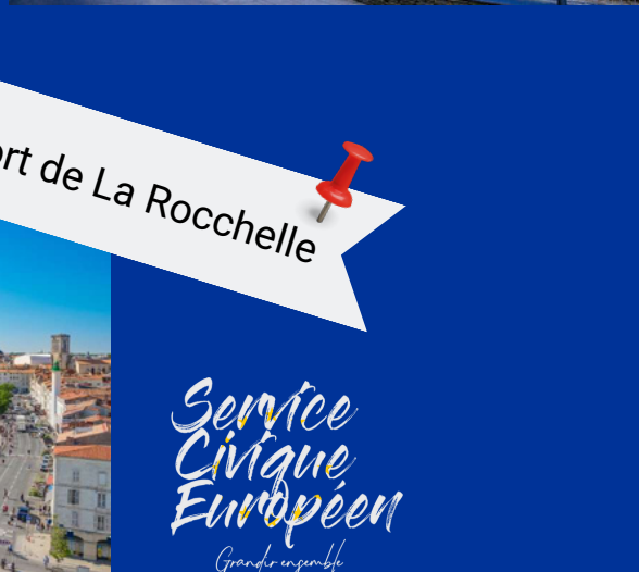
Port de La Rocchelle